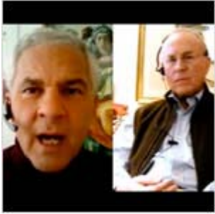
Bloggingheads: Reagan's Quest for Disarmament