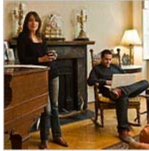
The Ghosts of Clinton Street