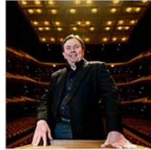
In Seattle, a Fugue for Orchestra and Rancor